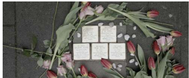
Here Lived Documentary Sunday, November 10 at 1:00pm