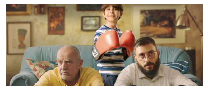
All About the Levkoviches Comedy/Drama Saturday, November 9 at 9:20pm