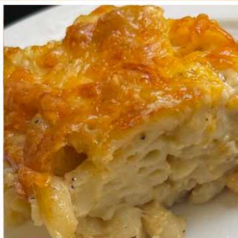
MAC N' CHEESE