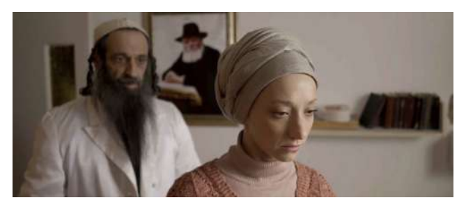
Barren Drama Sunday, November 5 at 7:00pm