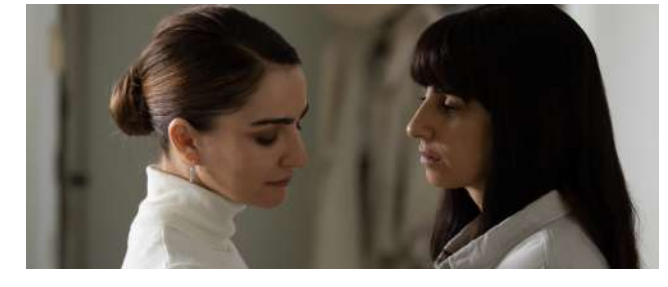
The Other Widow Drama