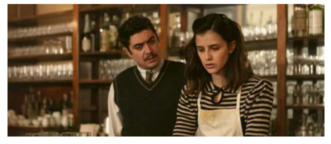
The Shadow of the Day Drama