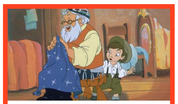
Something From Nothing Animated Short Film for the Entire Family