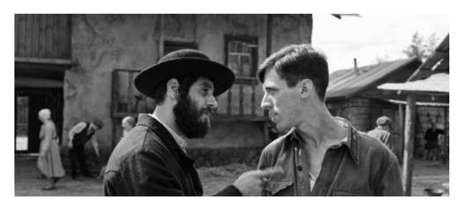
Shttl Drama Sunday, November 12 at 2:45pm