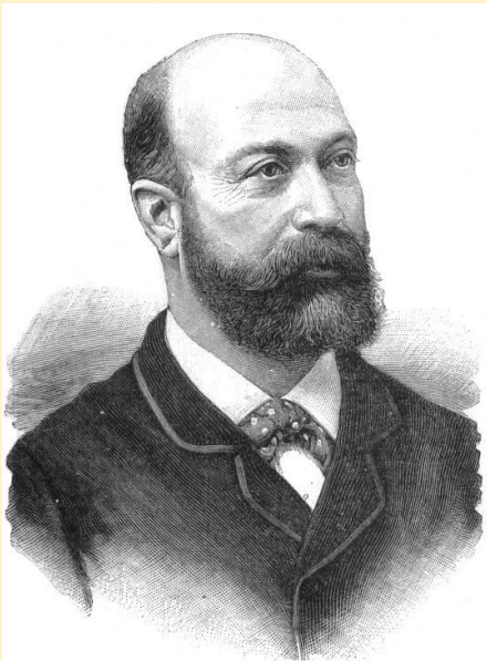
Baron Jacques de Reinach, 1893 Les Annales politiques et littéraires , 11e année, n° 497, 1er janvier 1893.